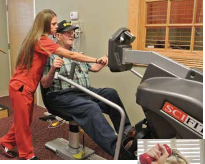
Rehab and Fitness Center